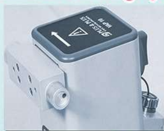
Cagemount Taper 23mm