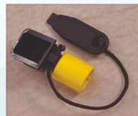
Quick fill drain adapter