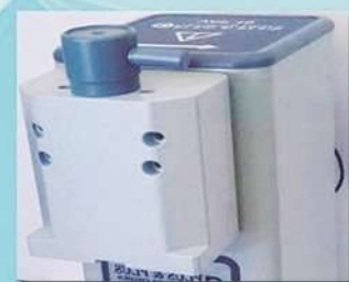
Drager Plug In Compatible