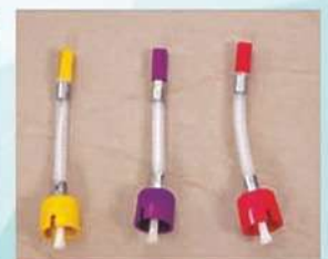
Key fill adapter