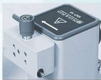
Selectatec® with interlock